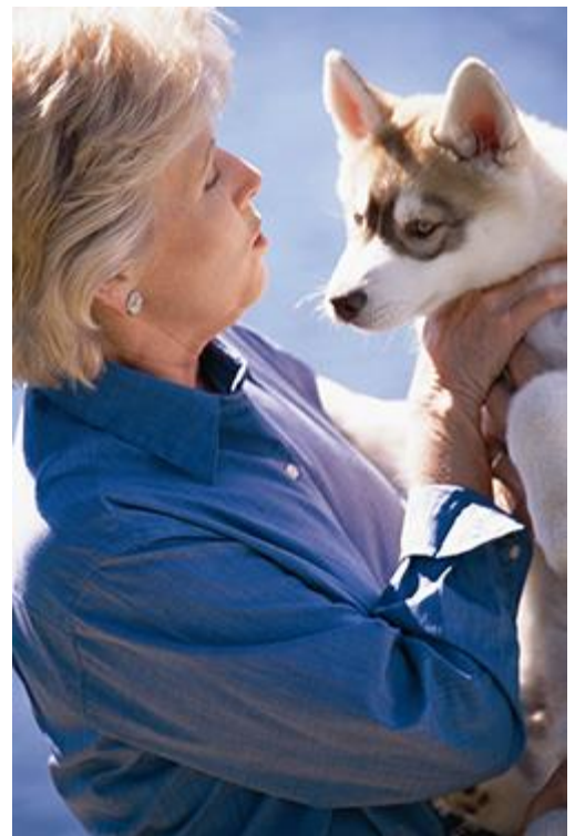
Table or people foods are not usually recommended for pets. Because they are usually very tasty, dogs will often begin to refuse their well-balanced dog food in favor of table food. If you choose to give your puppy table food, be sure that at least ninety percent of its diet is from a quality commercial puppy food. If not, follow a properly formulated recipe that has been developed by a formally trained veterinary nutritionist.

Each of the types of food has advantages and disadvantages. Dry food is definitely the most inexpensive. It can be left in the dog's bowl without spoilage for longer periods of time than canned or moist foods. Semi-moist foods may be acceptable, depending on their quality. The texture may be more appealing to some dogs, and they often have a stronger odor and flavor. However, semi-moist foods are often high in sugar and calories and should be carefully chosen based on their nutritional qualities rather than taste, packaging or consistency. Canned foods are a good choice to feed your dog, but are considerably more expensive than either of the other forms of food. Canned foods contain a high percentage of water, and their texture, odor, and taste are very appealing. However, canned food will dry out or spoil if left out for prolonged periods of time. Canned food is generally more suitable for meal feeding rather than free choice feeding.